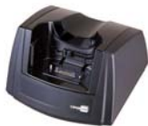
Charging and communication cradle/ Ethernet cradle