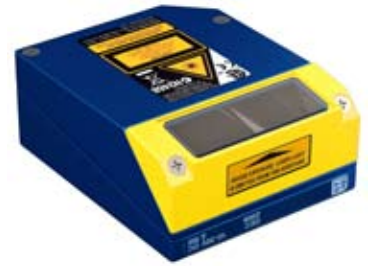
GFC-2100 90° Mirror Solution