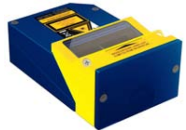
OM2000 Oscillating Mirror