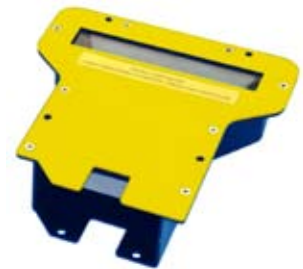
GFC-200 Contact Reading Mirror