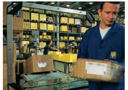
Distribution & Retail