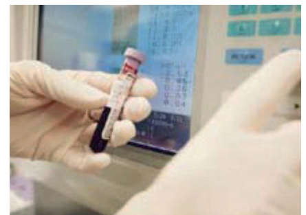
Medical & Pharmaceutical