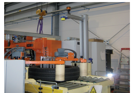
Tires Tracking & Tracing