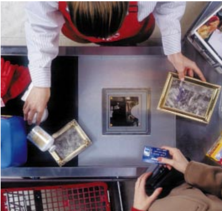
Symbol's LS 5800 is the in-counter scanner that saves you time and energy – pass items over the scan window and the improved optics find the bar code and scan it instantly.

Symbol Technologies presents the LS 5700 and LS 5800, the standard in hands-free point-of-sale retail laser scanning. These omnidirectional mini-slot scanners feature broad yet dense scan fields for unsurpassed throughput and a high first-pass read rate. The expanded working range and aggressive performance combine for fast, accurate scanning with minimal operator effort. The result is quicker, more productive, check-out operations – and happier customers.