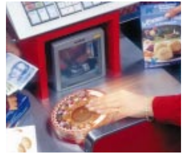
For your on-counter scanning at the point of sale, Symbol's LS 5700 offers high-speed "swipe" scanning, virtually eliminating the need to lift merchandise.