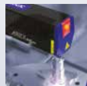
Laser Marking Systems