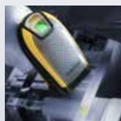
Hand Held scanners