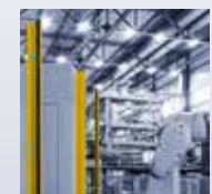
Safety Light Curtains