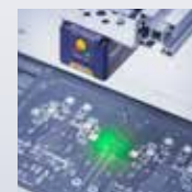
Stationary Industrial Scanners