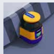
Safety Laser Scanner