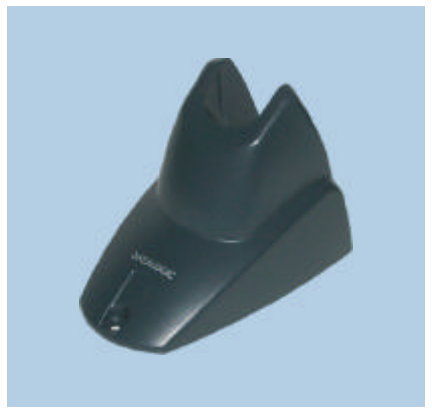
STD Heron™ Hands-Free Stand with optional metal plate