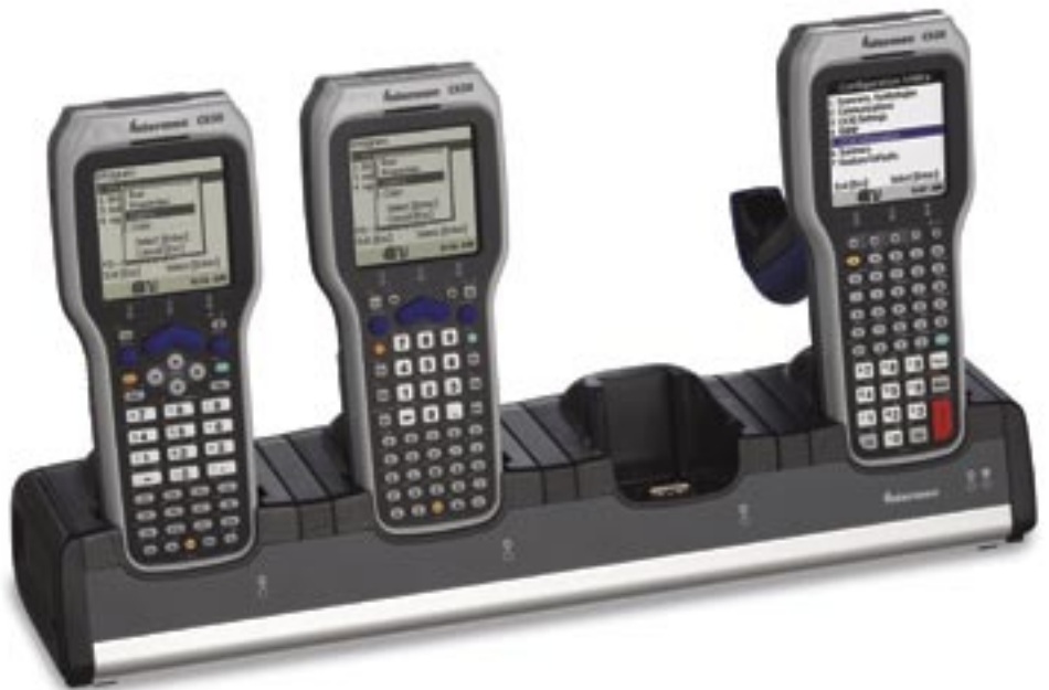
The CK30 batch model readily fits into a single or 4-bay communication dock with USB, RS232 or Ethernet host connectivity.

Position your enterprise for growth by selecting the 64MB RAM/64MB Flash model with a bright color display for the highest level of application flexibility. Or, choose less memory and a high contrast mono display for very thin clients or terminal emulation to reduce your initial investment. Additional configuration alternatives include Bluetooth™ for the convenience and flexibility of wireless peripherals such as wearable label printers.