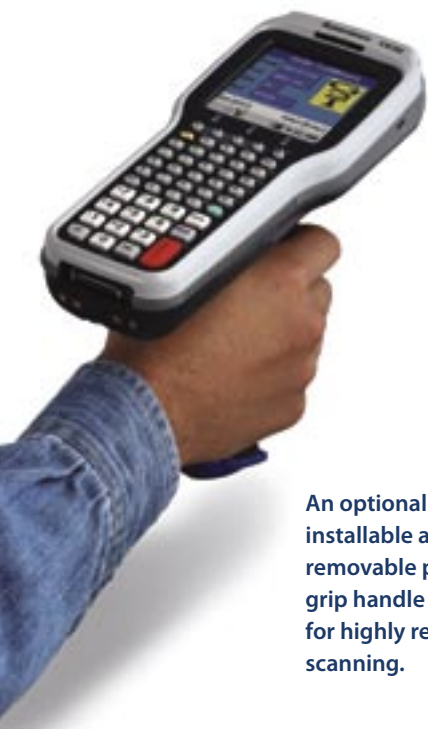
An optional user-installable and removable pistol grip handle is ideal for highly repetitive scanning.

The device offers new linear imagers that deliver reliability and ideal scanning capabilities for arm's length scanning applications. Users are also able to select laser scanners for either standard range or long-range applications. Additionally, an area imager option also supports 2D symbologies, and users can attach tethered scanners for additional ergonomic flexibility.