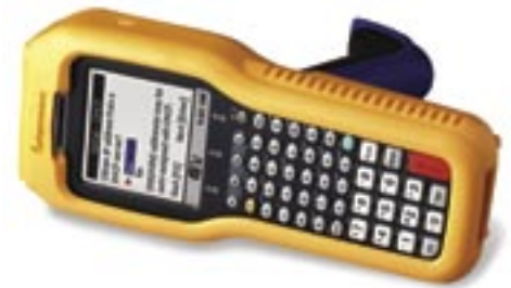
An optional protective rubber boot extends durability in extreme environments.

Web-based applications can easily be implemented either through Intermec's text-based dcBrowser™ or the bundled lock-down browsers based on Pocket Internet Explorer (CK30B) or IE6 (CK30C).