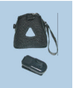
Gryphon™ Protective case